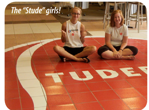
The “Stude” girls!