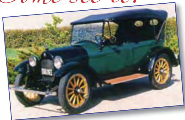
Minnesota's own PAN automobile courtesy of the "Pan-Towners" St. Cloud Antique Auto Club

300+ cars last year! We'll see you on Labor Day!