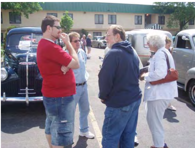
FOLKS, FANS AND SPECTATORS CHATTED ABOUT STUDES