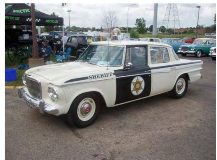
MUST BE LOTS OF FUN TO DRIVE. . .