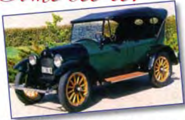
Minnesota's own PAN automobile courtesy of the "Pan-Towners" St. Cloud Antique Auto Club